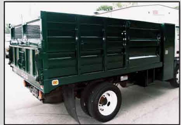
PLB-110B with KPLS-942463A