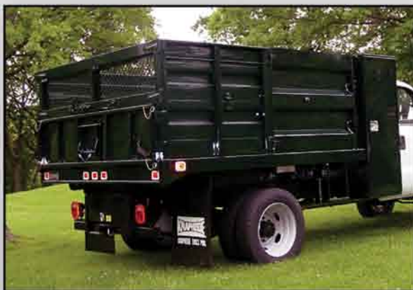
PLB-090B with KPLS-942463A