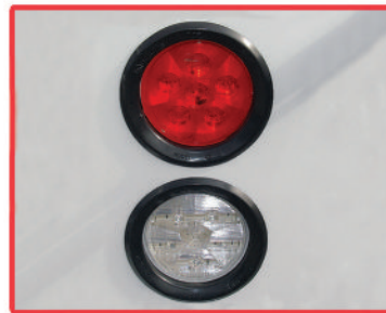
LED S/T/T Lights