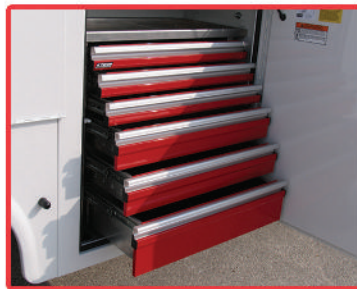
Aluminum Mechanic Drawers