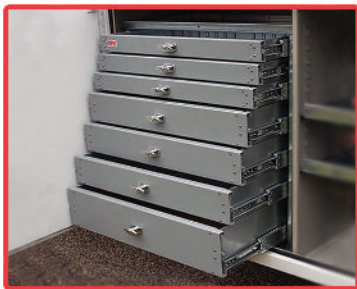
Steel Mechanic Drawers